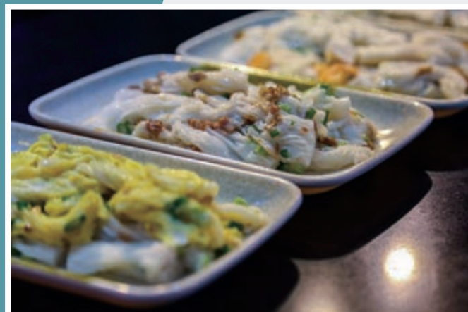
The TV series drew visitors to Jiangmen wanting to try local delicacies such as rice roll that are featured in the drama. — IC