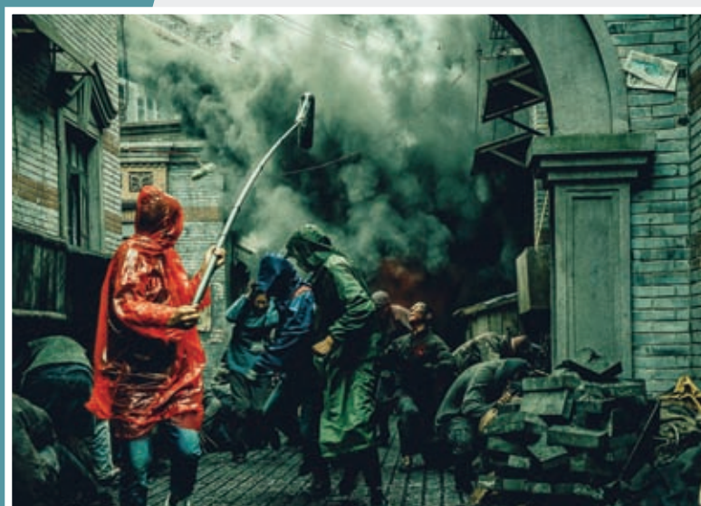
Cameras roll on a scene from “New Dawn”