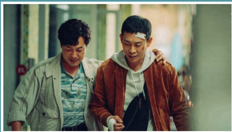
“The Knockout,” starring Zhang Songwen (left) and Zhang Yi, has become a phenomenal hit.